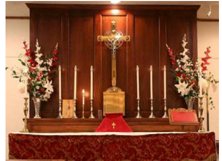
The new reredos at Christ Church Cathedral.