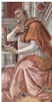
St Augustine, Botticelli (ca 1480)

The communal life of our order is based on the Rule of St Augustine, which is the oldest Monastic Rule (in the West). It is rich in wisdom and offers valuable teachings for all Christians.